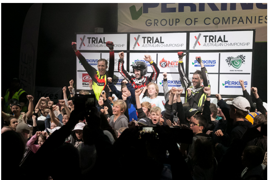
Figure 5: Podium with Spectators.